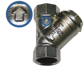
Please note flow direction